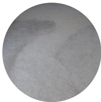
This is what a cut pile carpet can look like if shading occurs

Cut pile carpets, particularly plush pile carpets, may develop lighter or darker patches over time. Known as 'shading', 'puddling' or 'watermarking', it is caused by the permanent bending of the carpet pile fibres which then reflect the light differently. Brushing or shampooing does not reduce shading. The extent to which shading occurs cannot be accurately predicted or prevented. It does not affect the wear or durability of the carpet and is not recognised by Bremworth as a manufacturing flaw or defect.